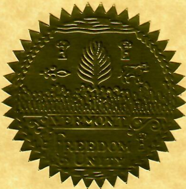
Philip B. Scott Governor

Given under my hand and the Great Seal of the State of Vermont on this 30th day of April, A.D. 2018.